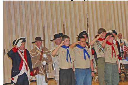
Scouts & Color Guard Salute our Flag.