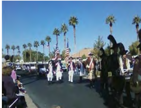
The Color Guard at Veterans Day parade in Pebble Creek AZ on 12 Nov 12.