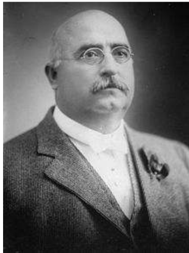
Governor George W. P. Hunt

Editor's note: George Wylie Paul Hunt was Arizona's first state governor and was governor of the state six times with an interesting twist as pointed out on the National Governors Association website www.naga.org , "In 1916 Thomas Campbell was declared the winner and held office [of governor] for nearly one year before the Arizona Supreme Court determined that in fact Hunt had won reelection." He died on December 24, 1934, and is buried in a large pyramid in Phoenix's Papago Park.