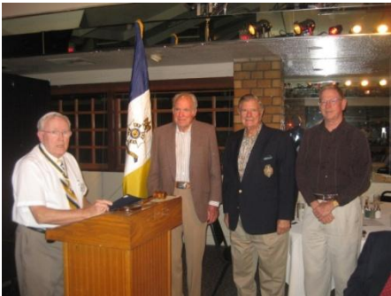
Congratulations to both and welcome!