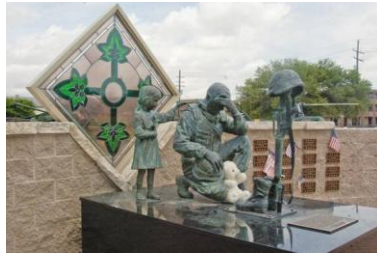
To the left of the kneeling soldier is a small Iraqi girl giving the soldier comfort as he mourns the loss of his comrade in arms.